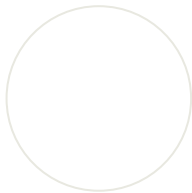
Laminate Polar White