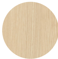
Laminate Natural Ash*