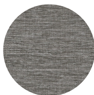
Mayer Fabrics Havana Metal