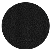
Stock Fabrics Genesis Flint