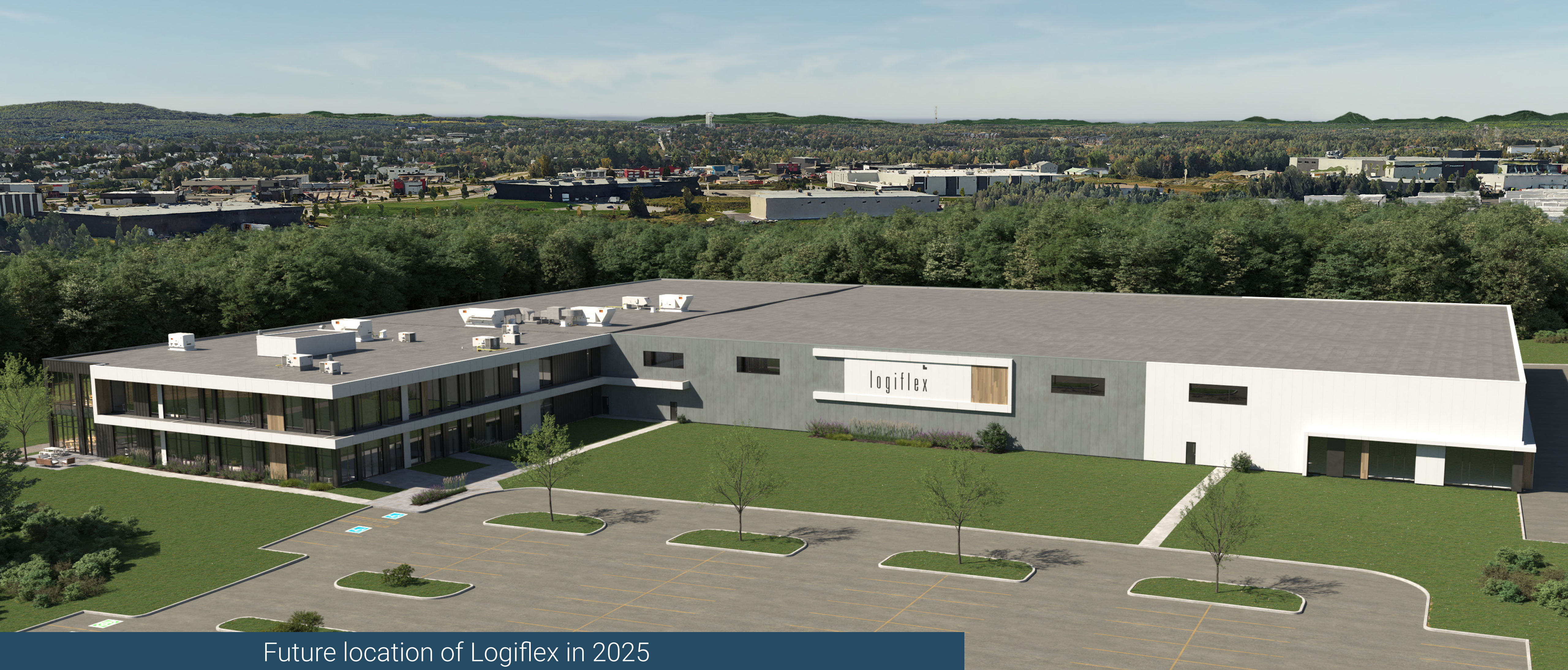
Future location of Logiflex in 2025