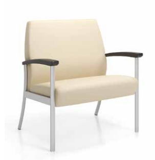
Mika - Bariatric seating