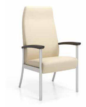
Mika - Patient seating