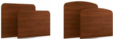
TLRT - PLRT TLCX - PLCX