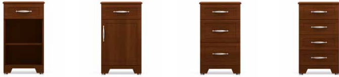
TC1 TC2 TC3 TC4