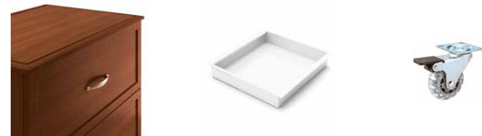
Spill-Guard Edge Plastic Drawer Liner Locking Casters