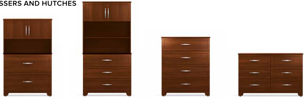
COM2 - HL28 COM3 - HLA40 COM4 COM6