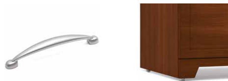
H160 Handle Bevelled Kick Plate