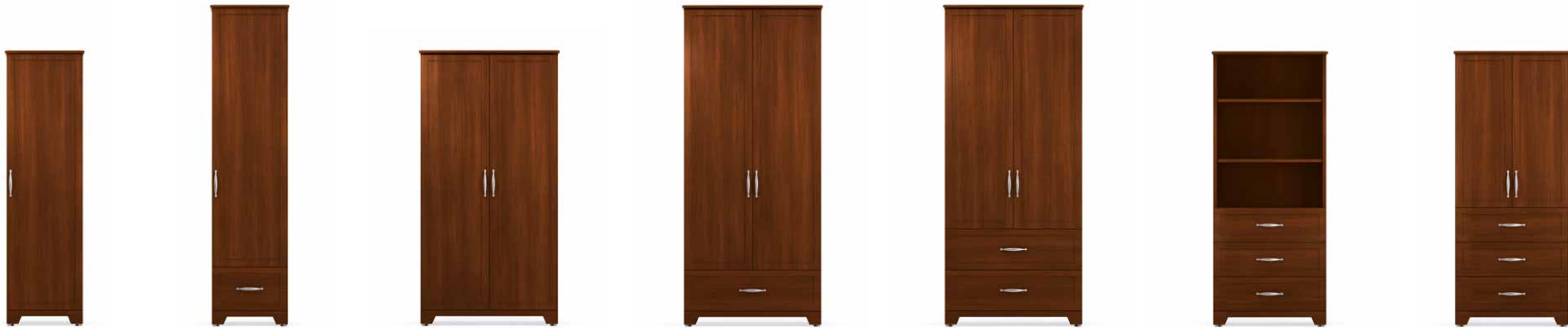
PEN1 PEN2 PEN3 - PEN4 PEN5 - PEN6 PEN7 - PEN8 RAN1 RAN2